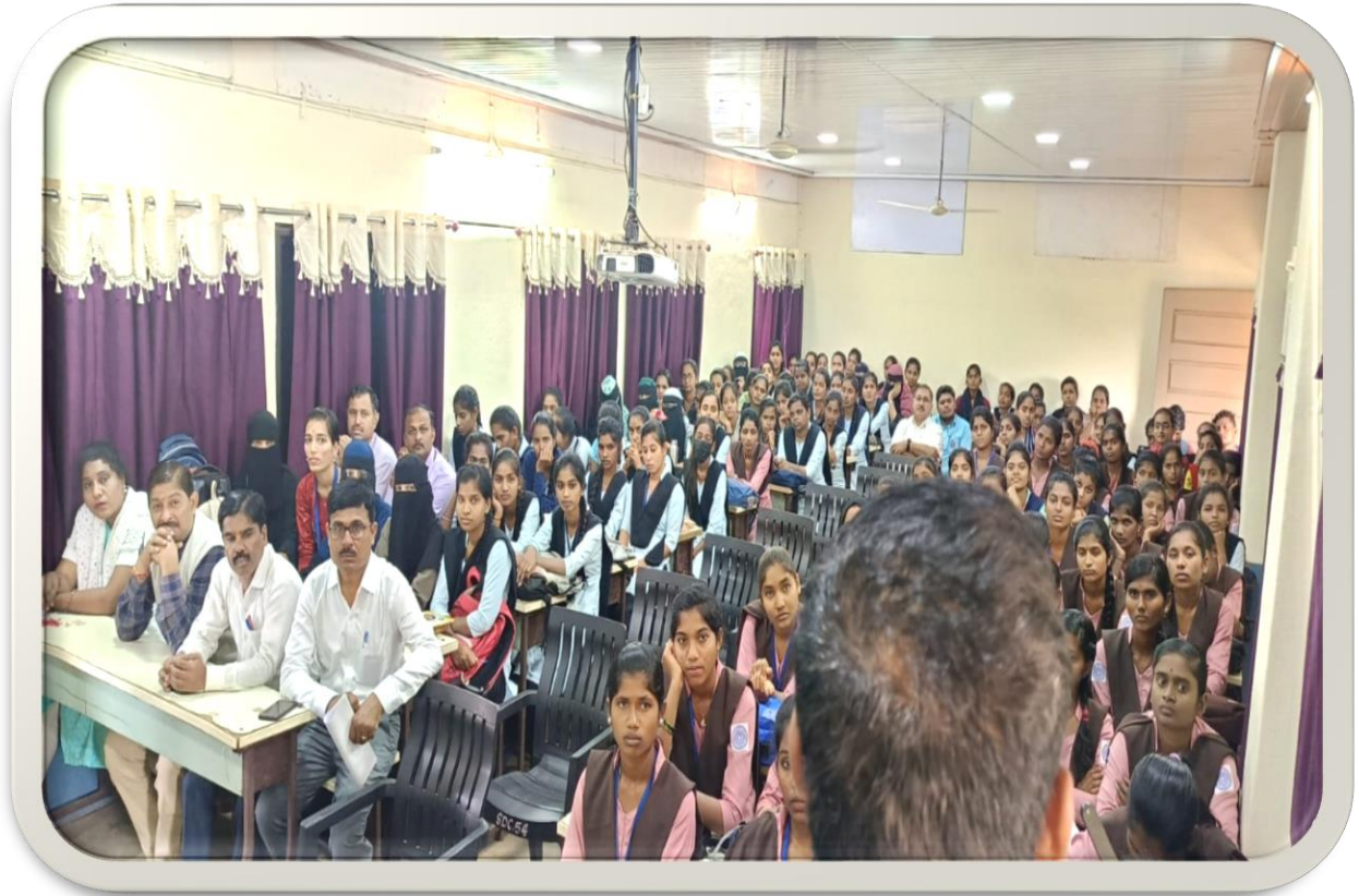
The students attended the workshop from various colleges of Bidar and Aurad