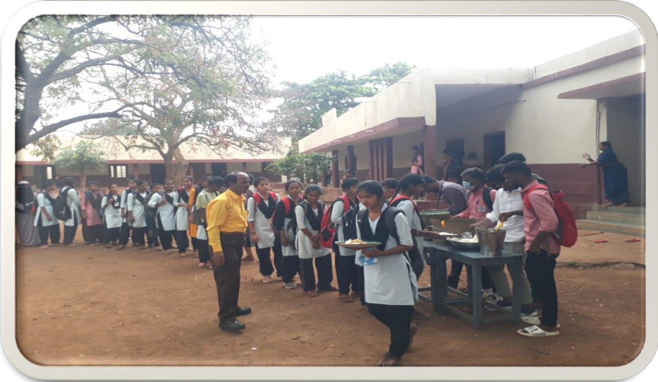
The Students are having a delicious lunch